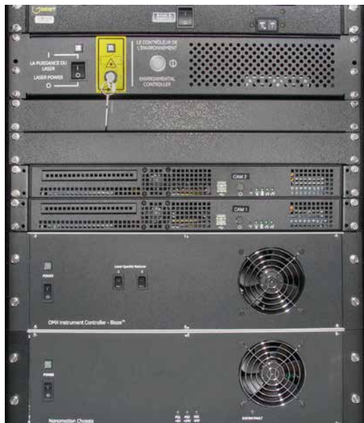
Fig 10. The system electronics are housed in a dedicated enclosure that also contains the laser module, computers and interface controllers.

To enable faster control of the system timing and trigger events the DeltaVision OMX SR system utilizes a custom programmable gate array that allows simultaneous control and activation of multiple system events. The result is extremely low operational overhead and superior event timing control that allows the system to operate at speeds beyond typical microscopes.