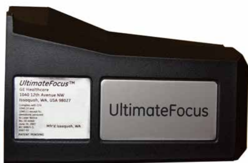
Fig 3. The UltimateFocus hardware autofocus module tracks samples and improves precision.

The UltimateFocus hardware autofocus module is standard on all DeltaVision OMX systems. The laser based hardware quickly brings a sample in to focus then locks on to track the focal position long term. The module provides: