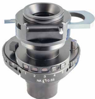
Fig 11. The optional Brightfield condenser enables DIC imaging on the DeltaVision OMX SR.

The DeltaVision OMX SR system can be used with an optional Brightfield condenser to help identify cell morphology and structure with imaging techniques such as DIC. DIC is based on polarized light and requires the use of a DIC capable lens in conjunction with optical components placed in the Brightfield condenser/trans-illuminator assembly and between the objective lens and the viewer or camera.