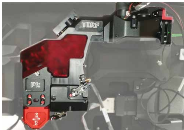
Fig 7. The Ring-TIRF/PK Module provides highly uniform illumination for TIRF and photokinetic based applications.

The DeltaVision OMX SR system can be fitted with an optional Ring-TIRF/PK Module that positions and rotates the laser beam within the back focal plane of the objective lens. This generates the TIRF field almost simultaneously from multiple points resulting in a highly uniform TIRF illumination. The Ring-TIRF/PK Module also incorporates an optical path that allows focusing and position control of the laser for photokinetic (PK) applications.