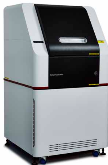
Fig 1. DeltaVision OMX SR is a compact super-resolution imaging platform for physiologically relevant live-cell imaging.