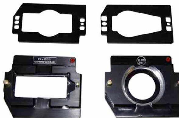
Fig 5. DeltaVision OMX SR sample holders are suitable for slides, dishes, and coverslips.

Incorporating our Nanomover™ motor, the DeltaVision OMX SR sample stage offers high-precision control and accuracy. The z-axis control has an additional piezoelectric drive for high-speed positioning during z-stack acquisition.