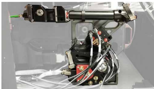
Fig 6. The Blaze SIM enables high-speed 2D and 3D super-resolution imaging in live cells.

Simple line gratings cannot generate the necessary pattern to allow full 3D super-resolution reconstruction or full optimization of each excitation wavelength. The Blaze SIM uses an optomechanical light pattern generator incorporating high-speed galvanometers for manipulating the light beams necessary to generate the 3D-SIM pattern.