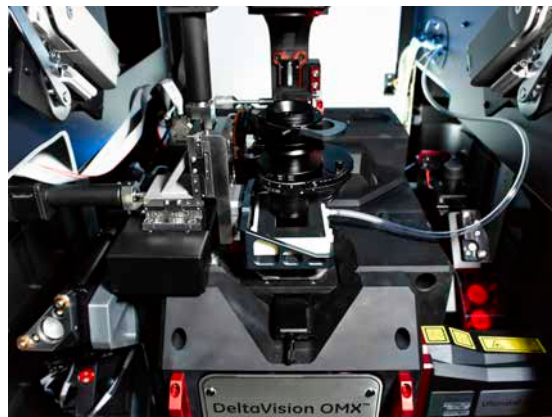
Fig 2. The DeltaVision OMX SR optical block provides the stability required for super-resolution imaging.