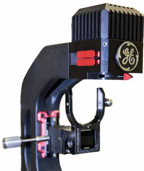
Fig 8. The transilluminator assembly included with the DeltaVision OMX SR enables a range of imaging modes.

Brightfield imaging with DeltaVision OMX SR uses a specially designed transilluminator arm assembly that incorporates a long-life white light LED rated as 100 Lumens at 350 mA. An optional brightfield condenser can be mounted on the illumination arm allowing differential interference contrast (DIC) imaging and other transmitted light modes to be selected.